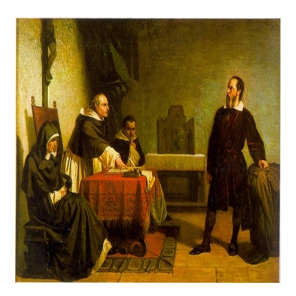
Figure 2. "Galileo_what really happened" [5].

From history, we can see that the worldview of scientism has affected several other worldviews such as: positivism (true knowledge must become scientific), social Darwinism (an attempt to derive purpose and meaning scientifically), sociobiology and evolutionary psychology (derive values and morality scientifically) and lastly: 'new' atheism. I will briefly discuss new atheism here to show that it really comes from the worldview of scientism[3].