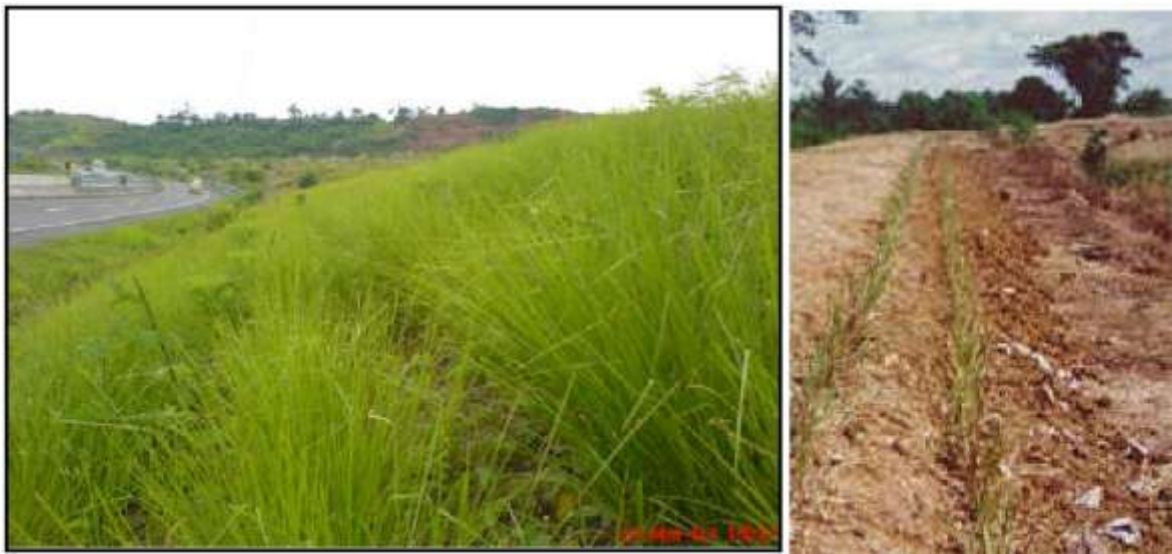
Figure 1 Vetiver Grass

Vetiver grass is a tropical plant which grows naturally. The species which is most common is referred to in scientific term as Vetiveria zizanioides . This species appears in a dense clump and grows fast through tillers. The clump diameter is about 30 cm. and the height is 50-150 cm. The leaves are erect and rather stiff with 75 cm of length and 8 mm of width.