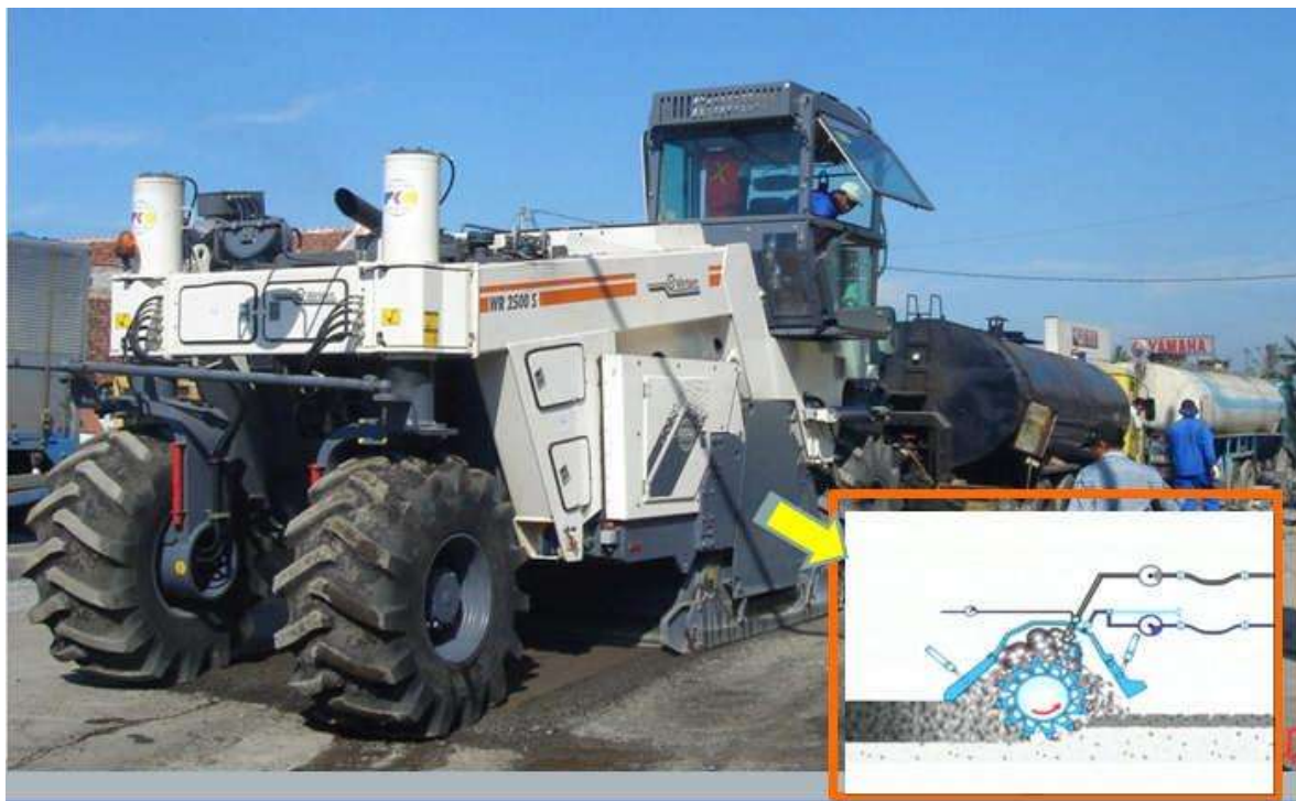
Figure 3 Recycling Equipment