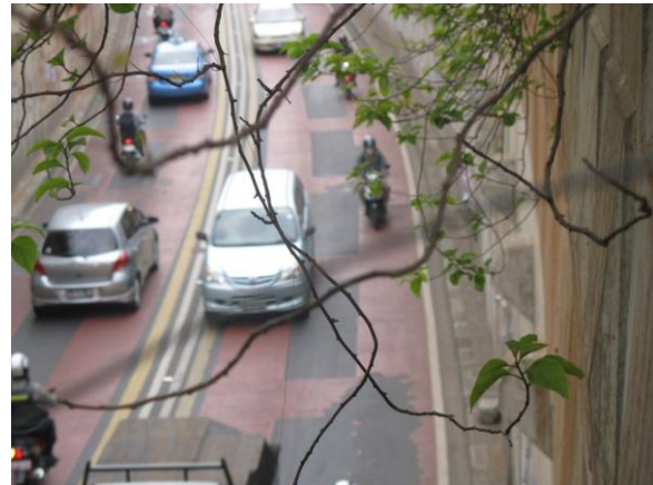
Figure 3 Camera View for Speed and Flow

Travel speeds were calculated by dividing light vehicle travel times with the underpass length (67.7 m). Space mean speeds were calculated as a light vehicle travel mean speeds/ 5 minutes. The observation of each light vehicle travel times (to get each light vehicle travel speeds) was conducted for the first 15 minutes of three observation periods. Sampling error of 30 seconds sampling interval was calculated by Equation 1.