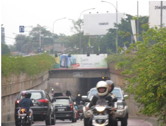
Figure 2 View of the Underpass Taken from Simprug